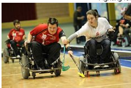
Fighting for the ball