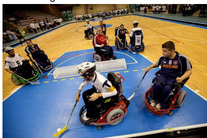
Around the goalnet