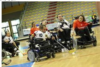
Fighting for the ball