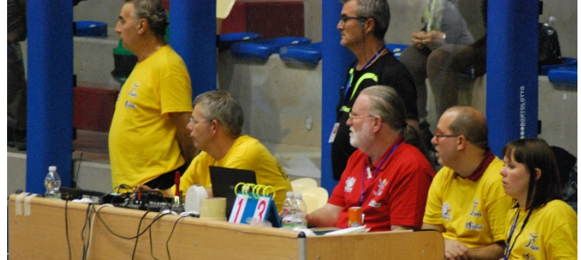
The volunteers of the Tournament with their yellow