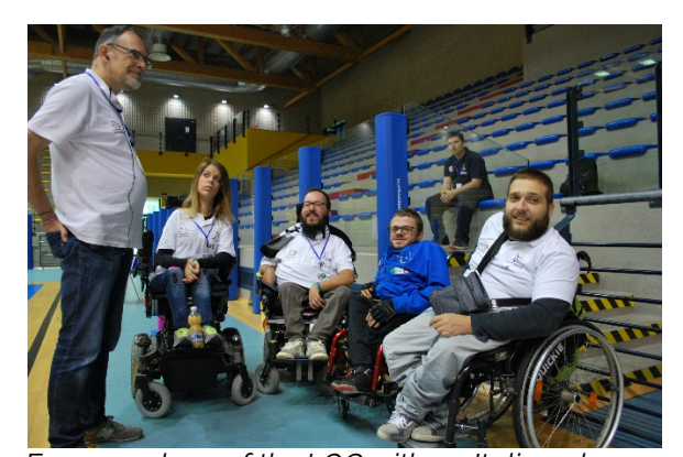
Four members of the LOC with an Italian player

Organization could count on the support of about 15 volunteers involved as drivers, field assistants, streaming production, photographers etc.