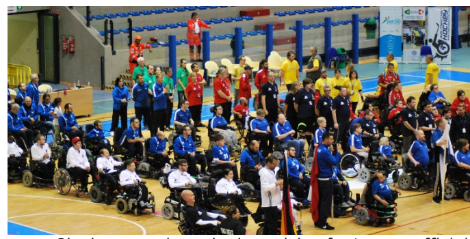
Closing parade and prizes giving for teams, officials,