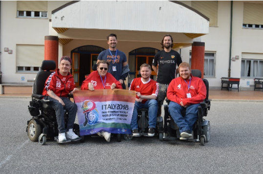
Team Denmark outside the hotel "Le Vele"