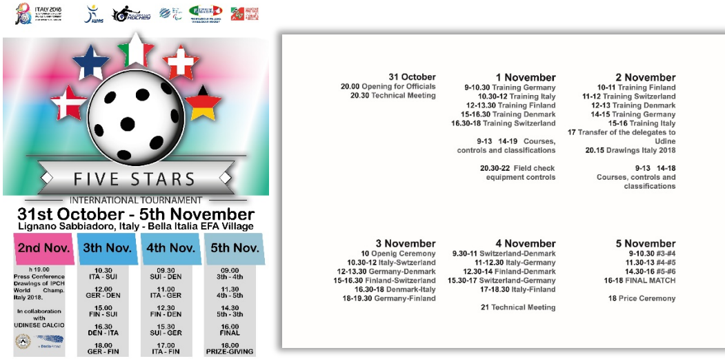
The poster and flyer's front

A5 - Is printed on the both sides. The front side is identical to the A3 flyer while the beck has a detailed scheduling of all the activities. This flyer was given to all the participants and used also as a program book. LOC studied this cheap solution to save money on this budget's item.