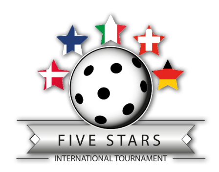
The logo designed by LOC

The logo has a simple design which represents a powerchair hockey ball surrounded by stars with the colors of the flags of the Nations involved in the tournament. Under this design there is the title. These parts, all together, remind us a hypothetical 5 Stars hotel logo and tell us about the quality that organizers wanted to reach.