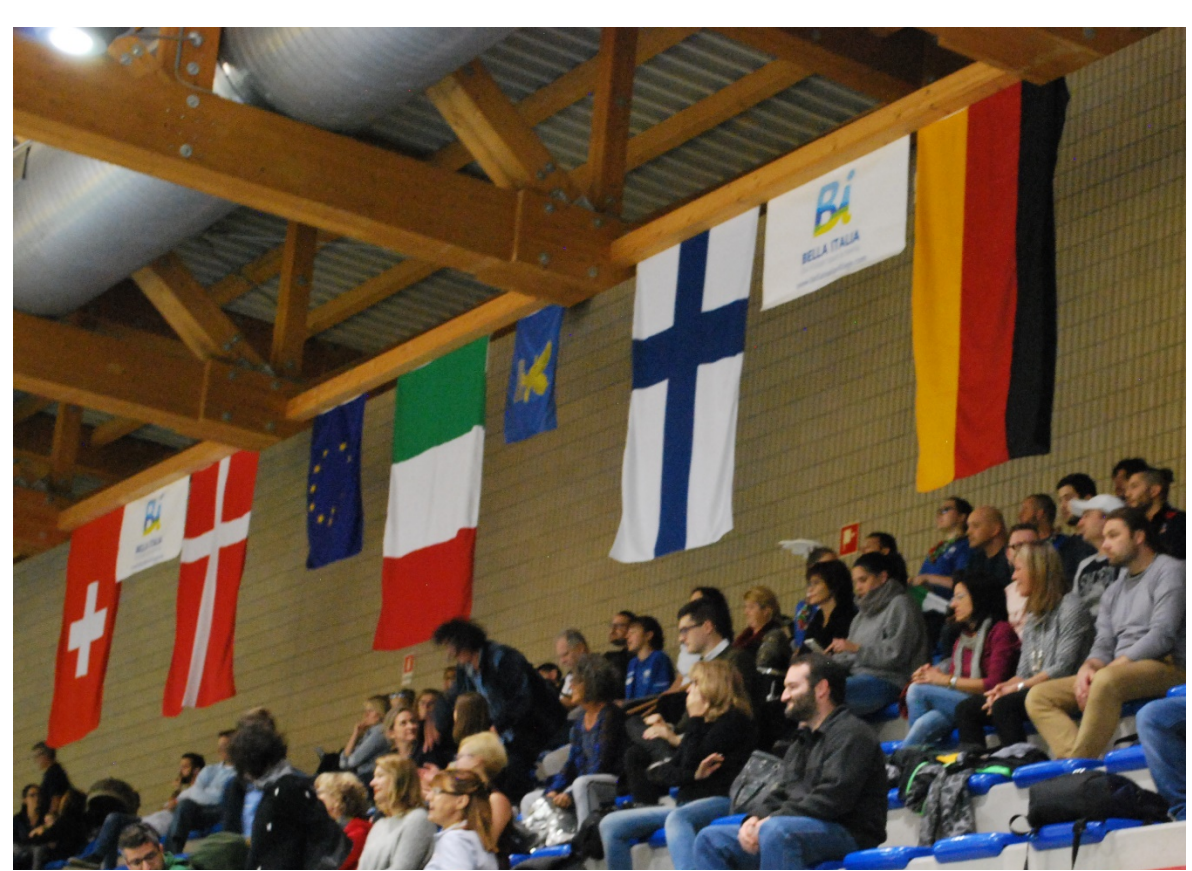
The five flags of the teams